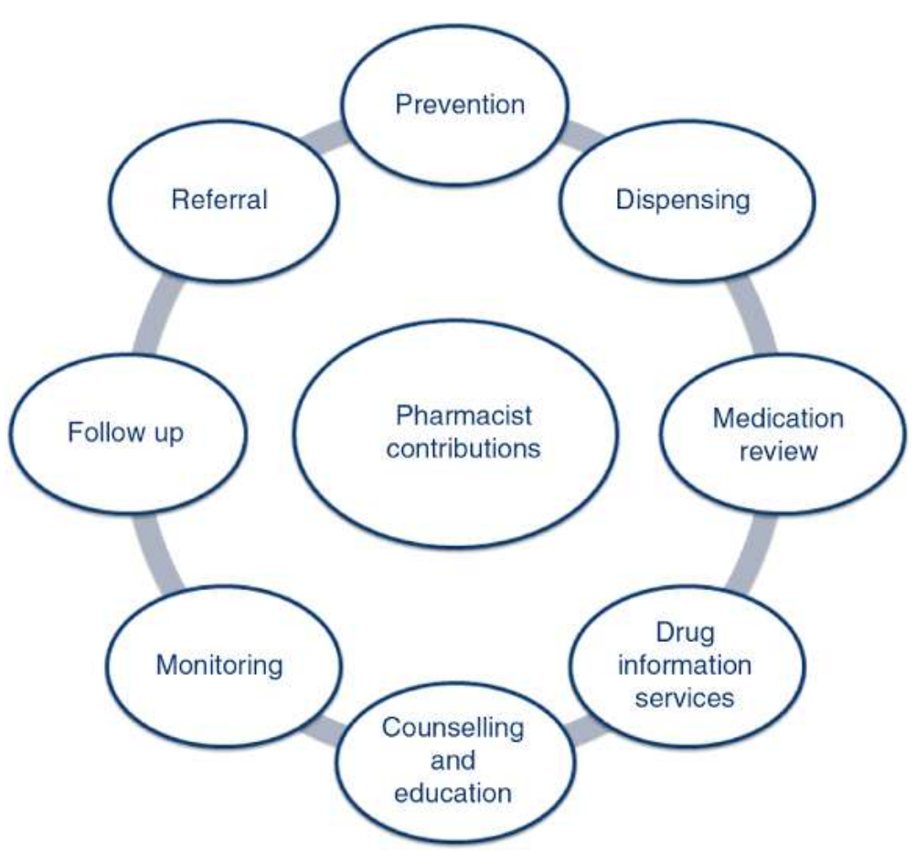
Figure 02: Different contributions of pharmacist

Volume 8, Issue 2 Mar-Apr 2023, pp: 533-539 www.ijprajournal.com ISSN: 2249-7781